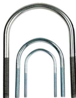
Fig. 137 Standard U-Bolts from 3/4" to 16" in low carbon steel and 304 & 316 stainless, in stock and available for immediate shipment. Other sizes and specifications, including square bend U-bolts, manufactured to order.